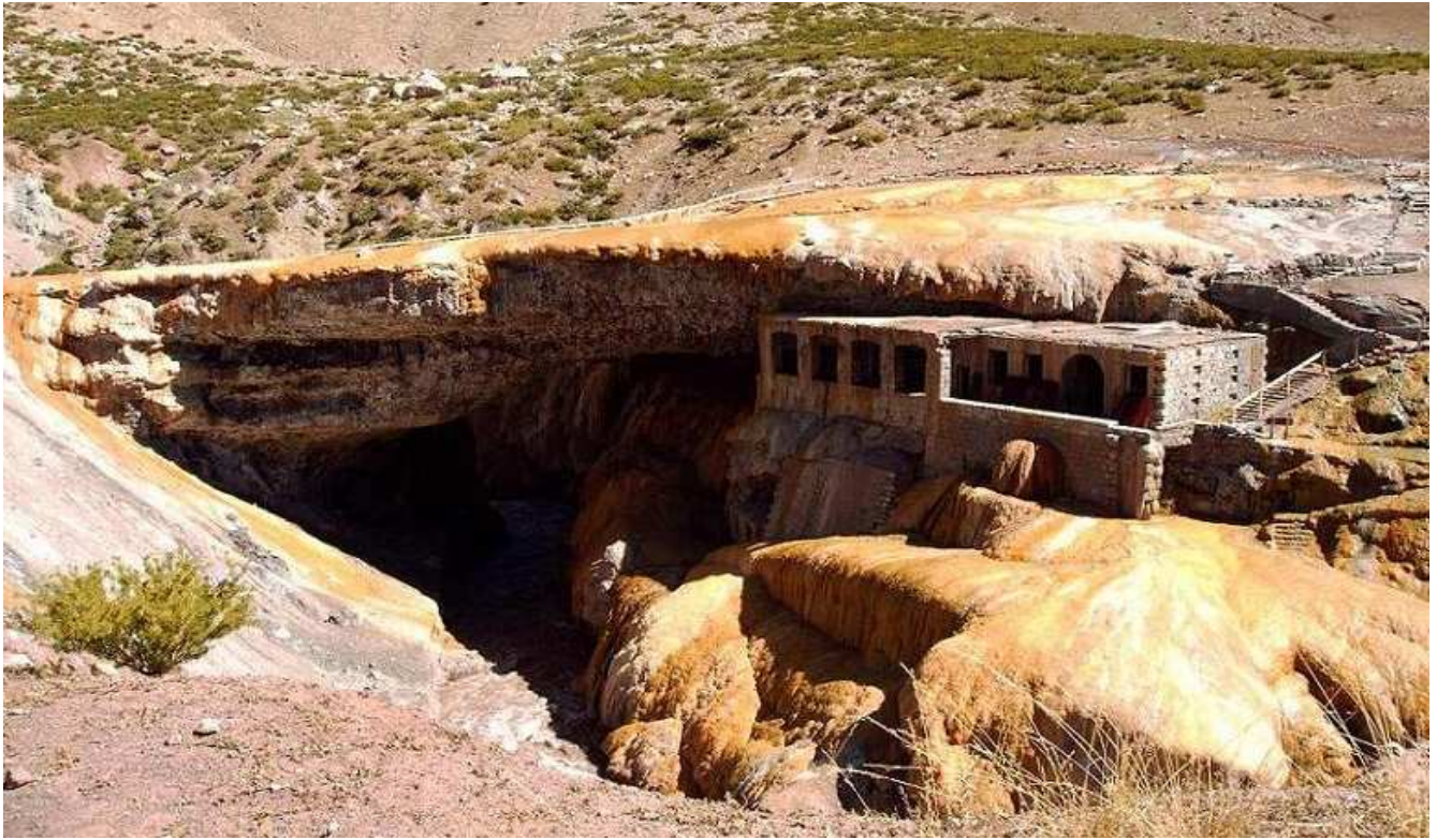
This hotel in Argentina has been built into the natural landscape.