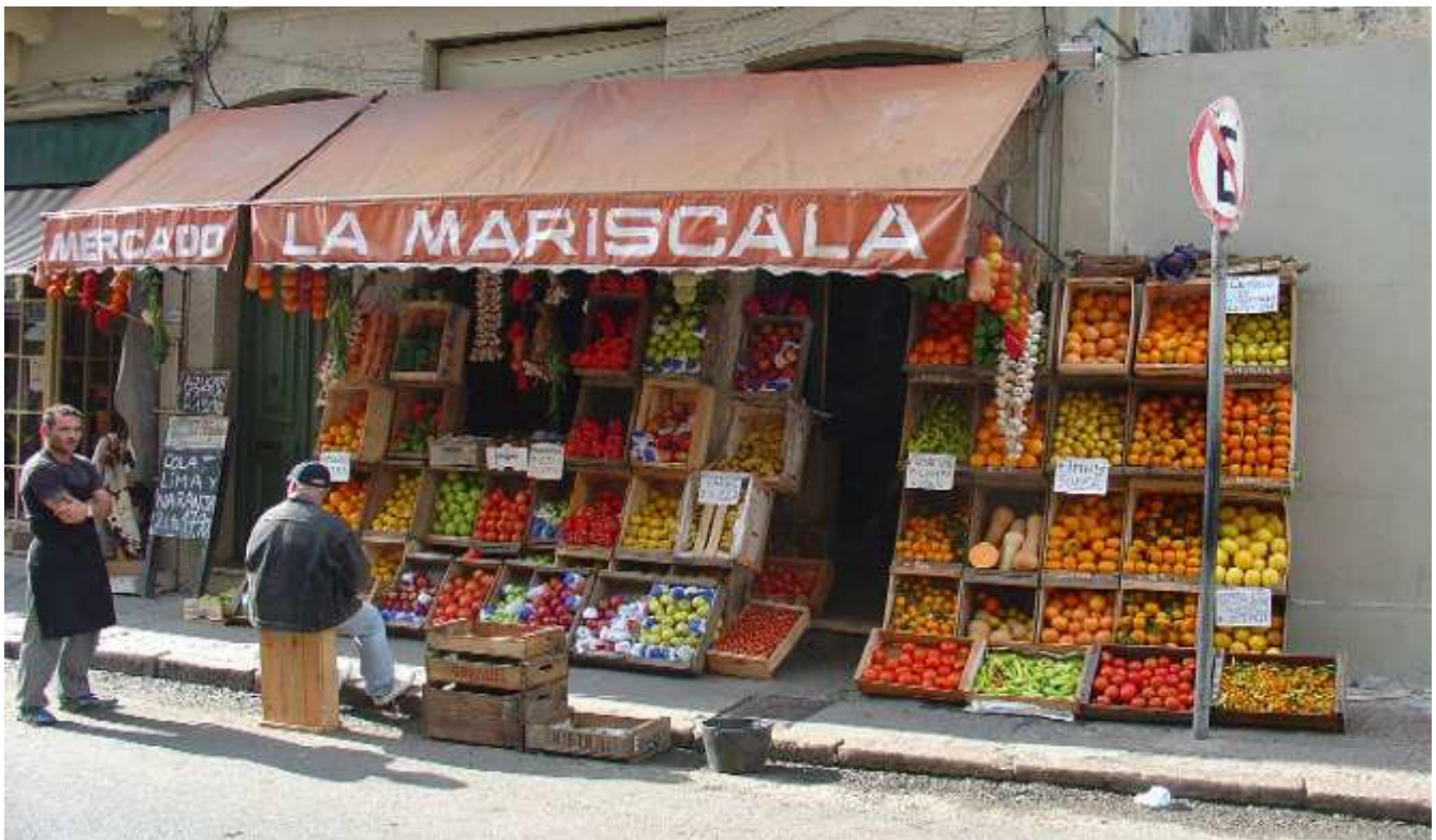
This market in Uruguay sells lots of fruits and vegetables.