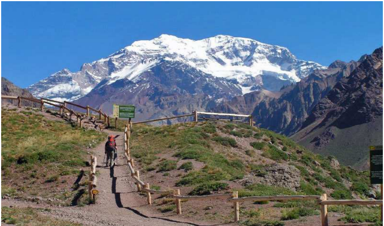
The highest mountain peak in Argentina is covered with snow.