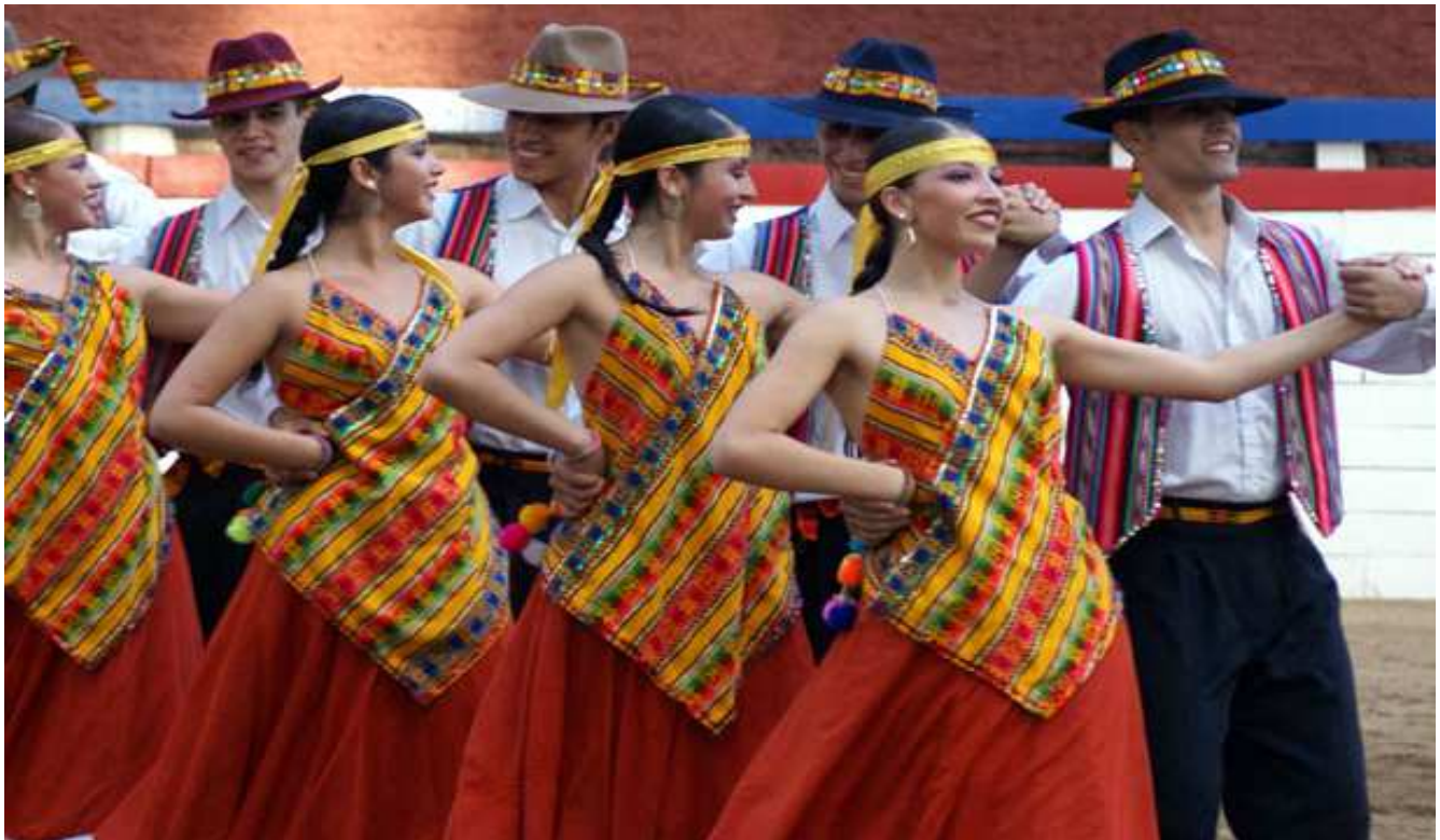
The dancers are dressed in traditional Chilean folklore clothing.