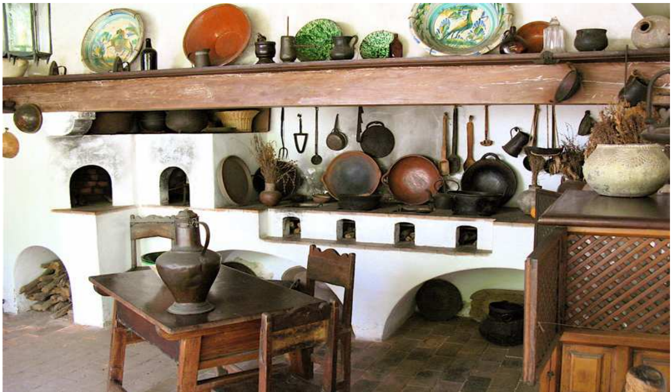
There are many items in this old Venezuelan kitchen.