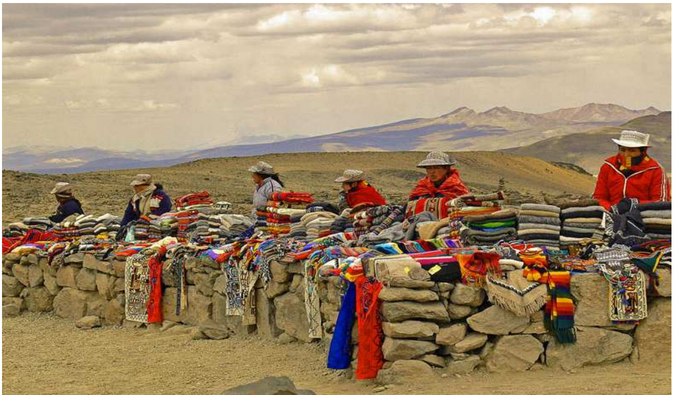
These women in Peru are selling goods made from alpaca wool