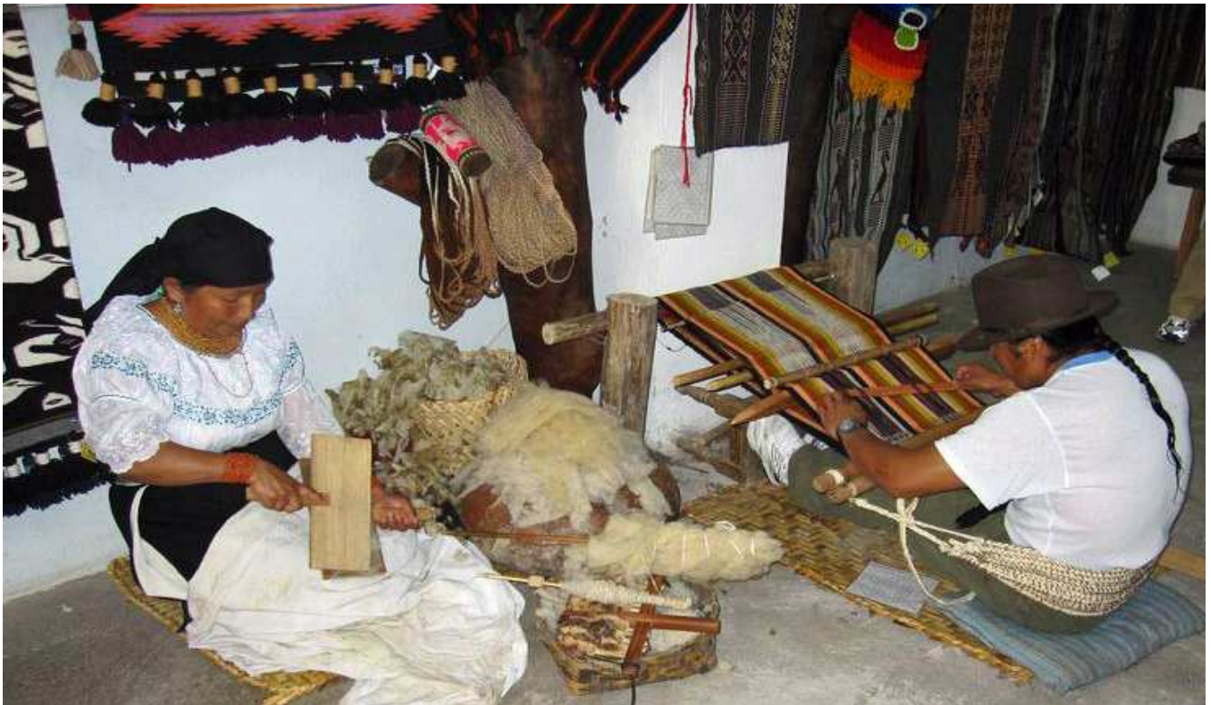
Many blankets are woven by hand in Ecuador.