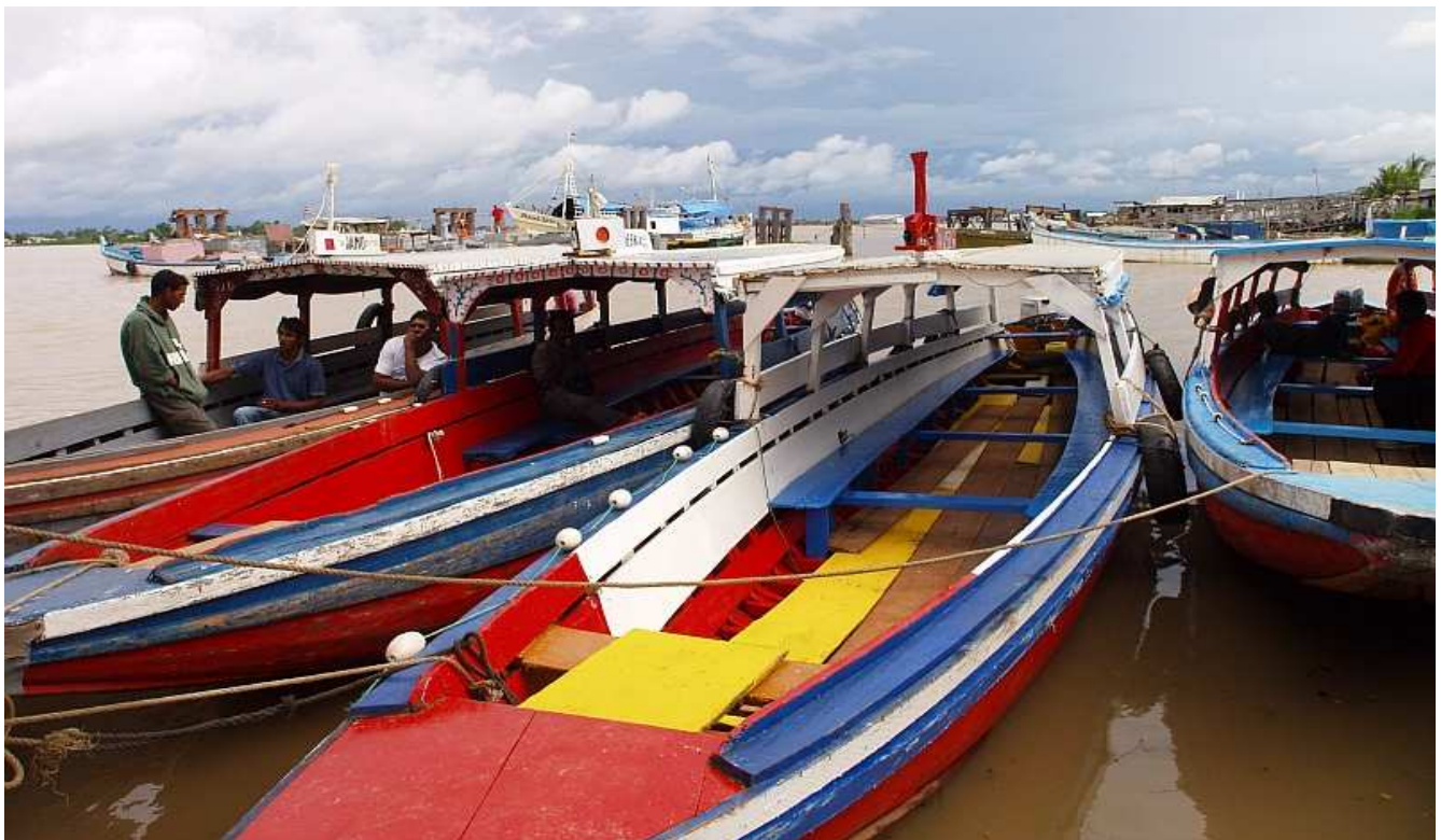
These boats transport people along the rivers in Suriname.