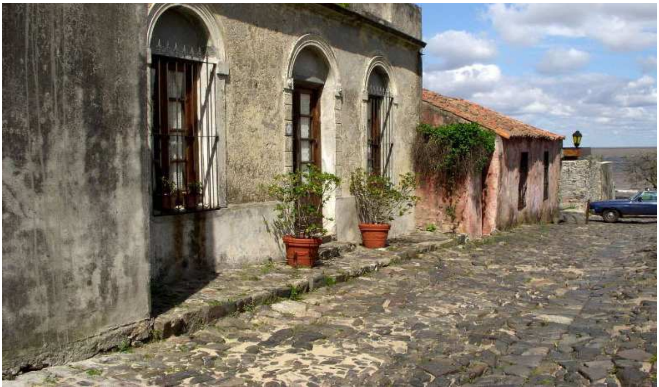
Many old villages in Uruguay have cobblestone roads.