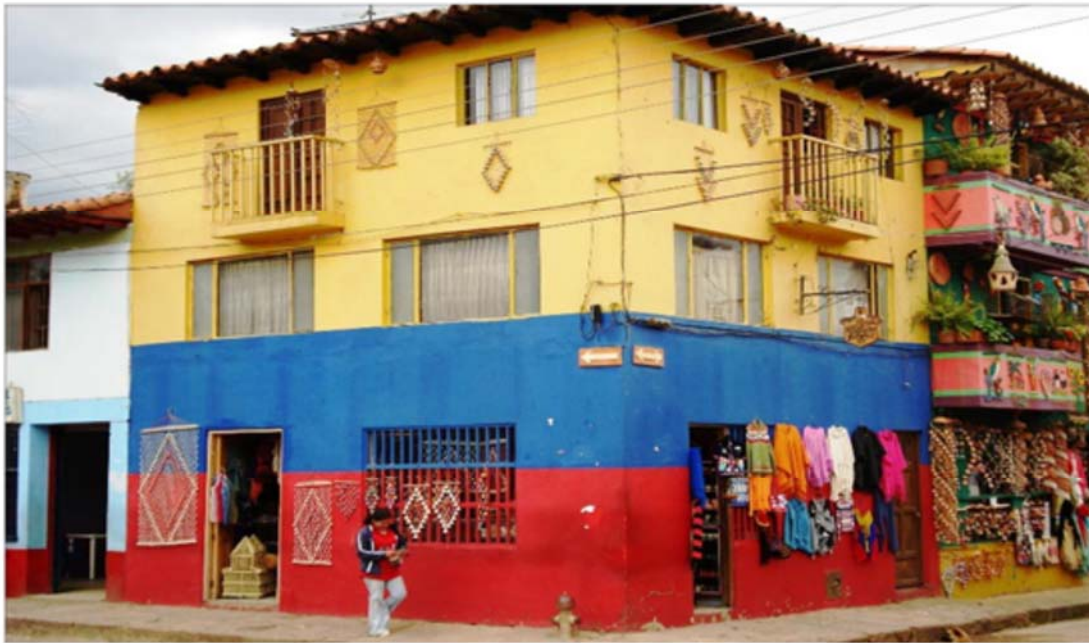
This home in Colombia is painted the same colors as the country's flag.