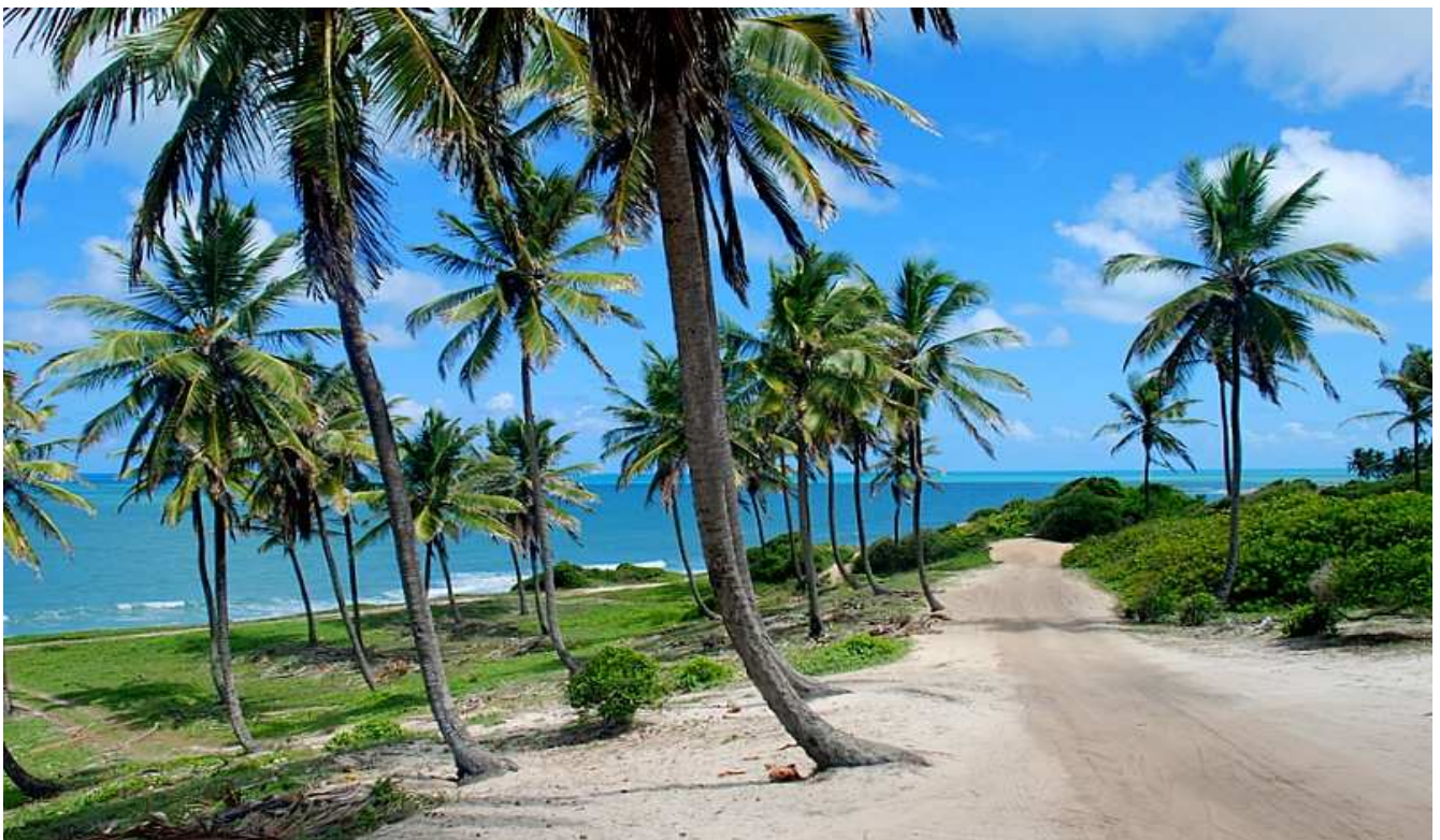
Palm trees line many of the dirt roads in Brazil.