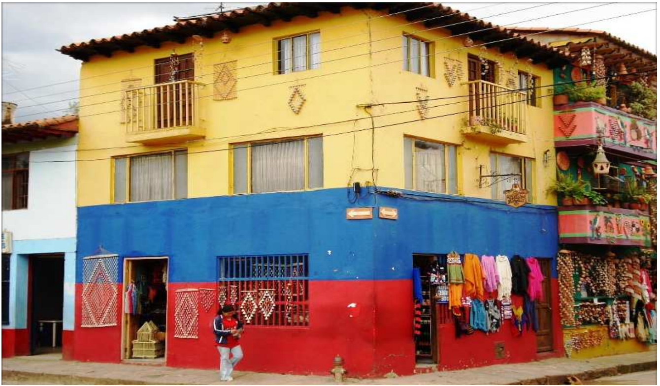
This home in Colombia is painted the same colors as the country's flag.