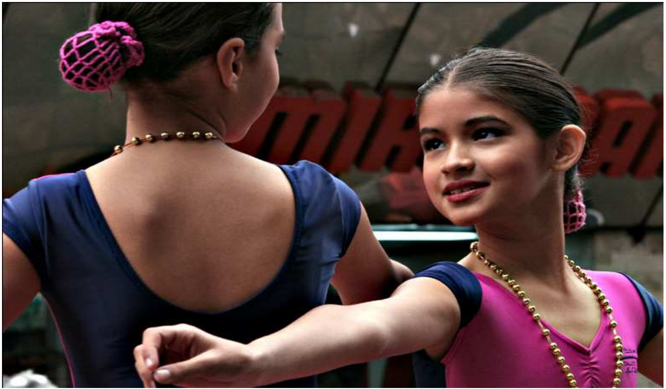
These young girls are dancing in Paraguay.