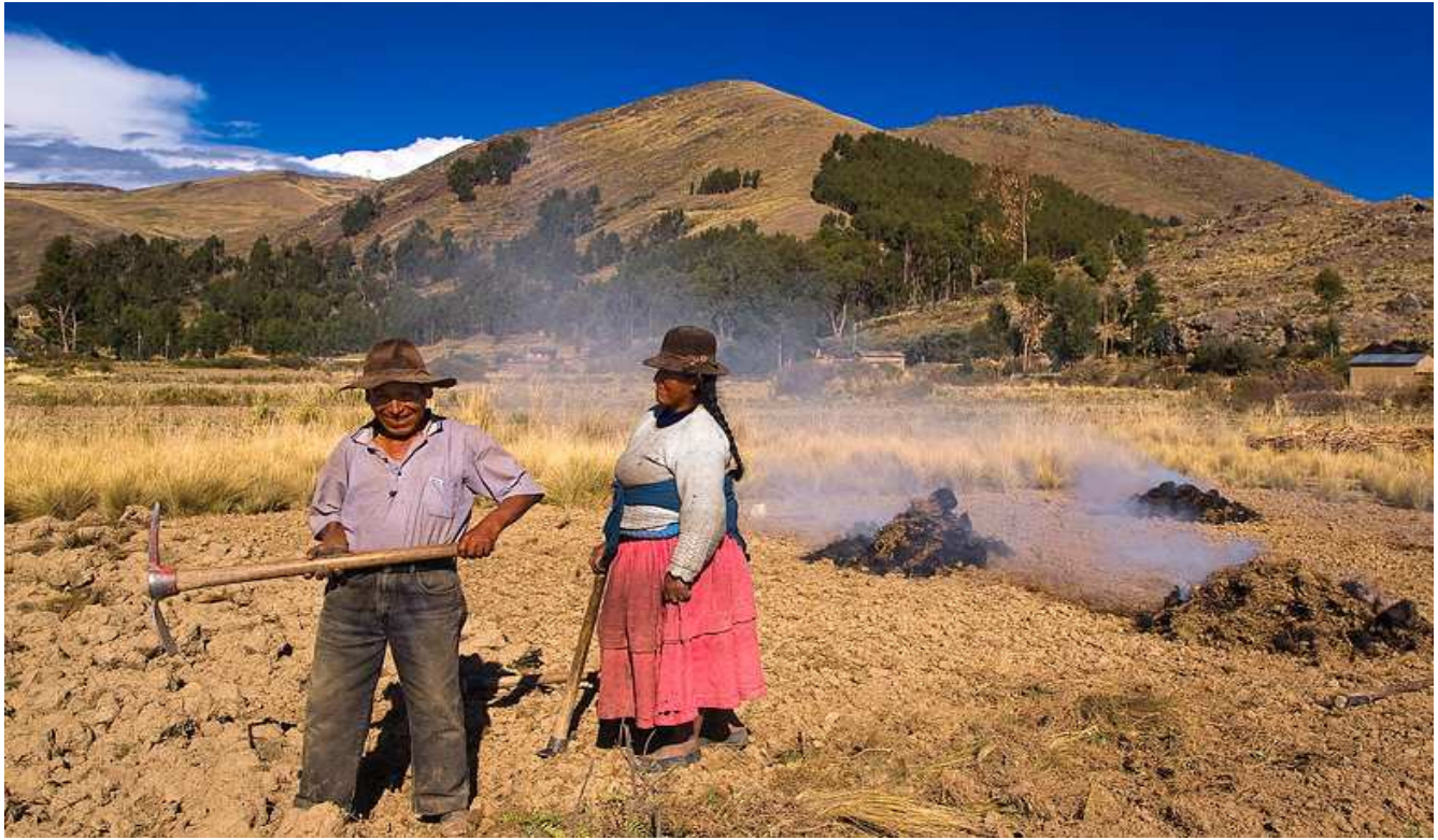
These farmers in Bolivia are working hard to prepare the land for planting.