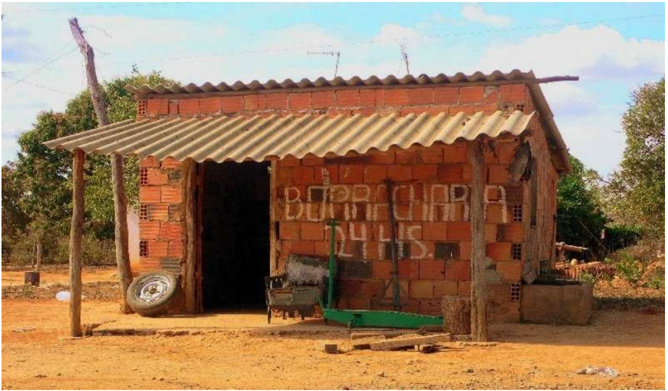
This is a tire repair service shop in Brazil.