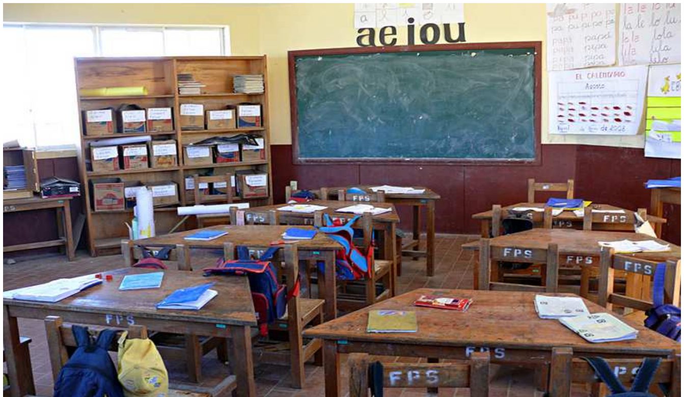
Children in Bolivia attend this primary school.