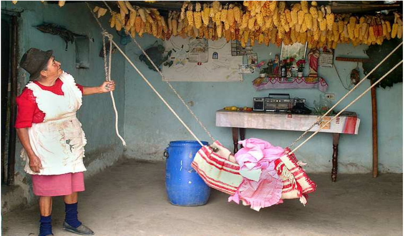
A Colombian grandmother rocks her grandbaby to sleep.