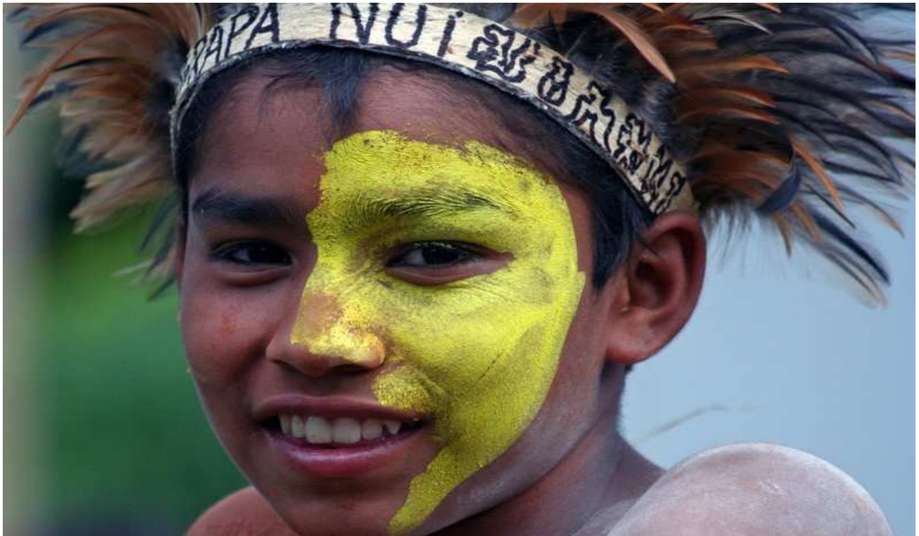
This young boy from Chile is ready for a festival.