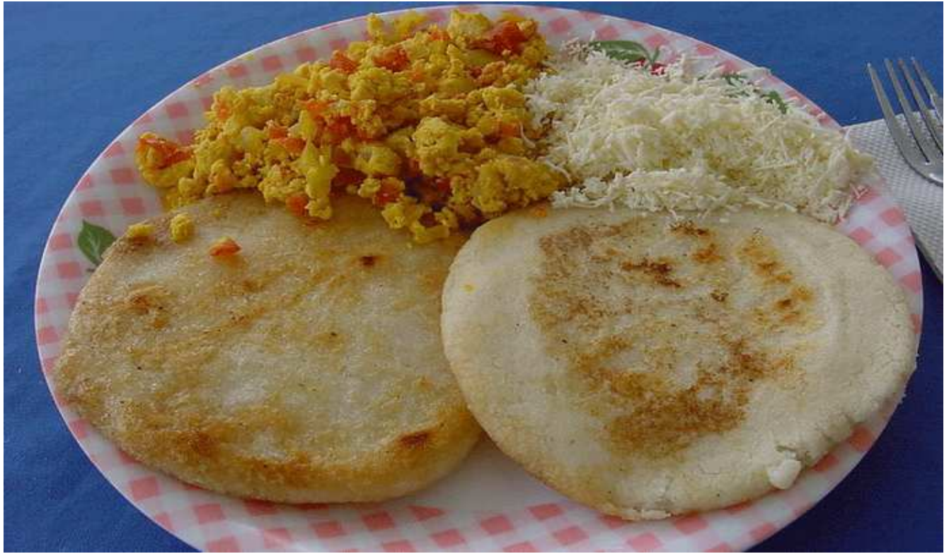
Fried cornmeal bread and scrambled eggs are eaten in Venezuela.