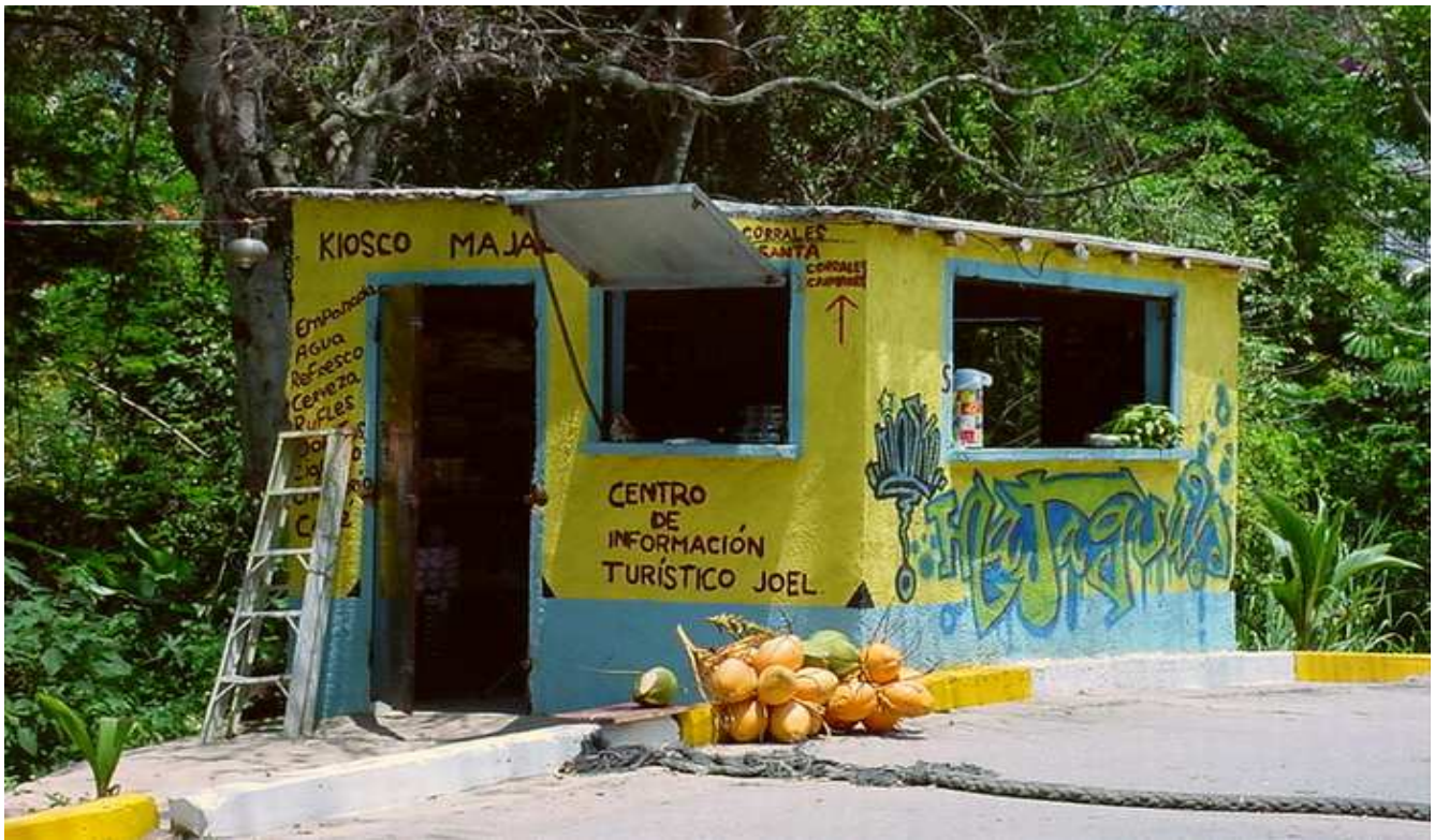
This shop is an Information Center for tourists in Venezuela.