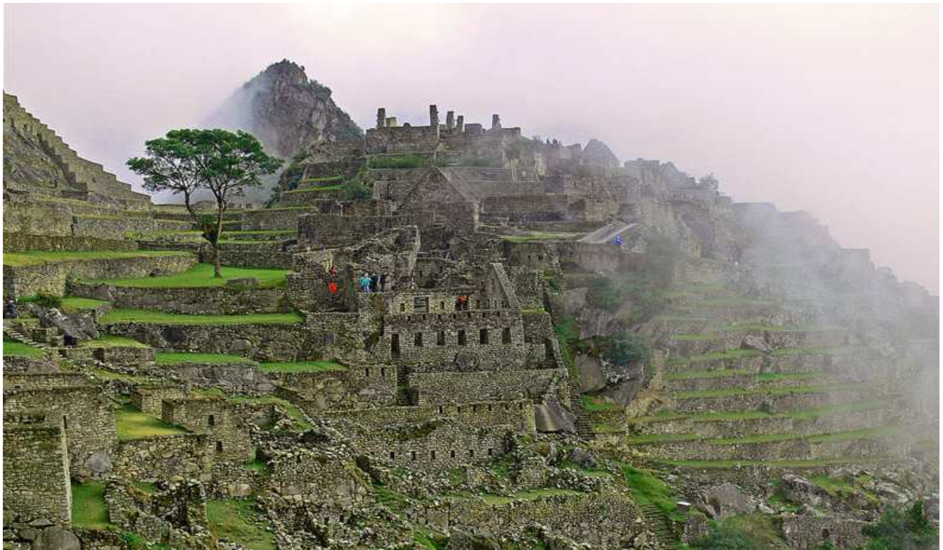
Machu Picchu is an ancient village built on a high mountain ridge in Peru.